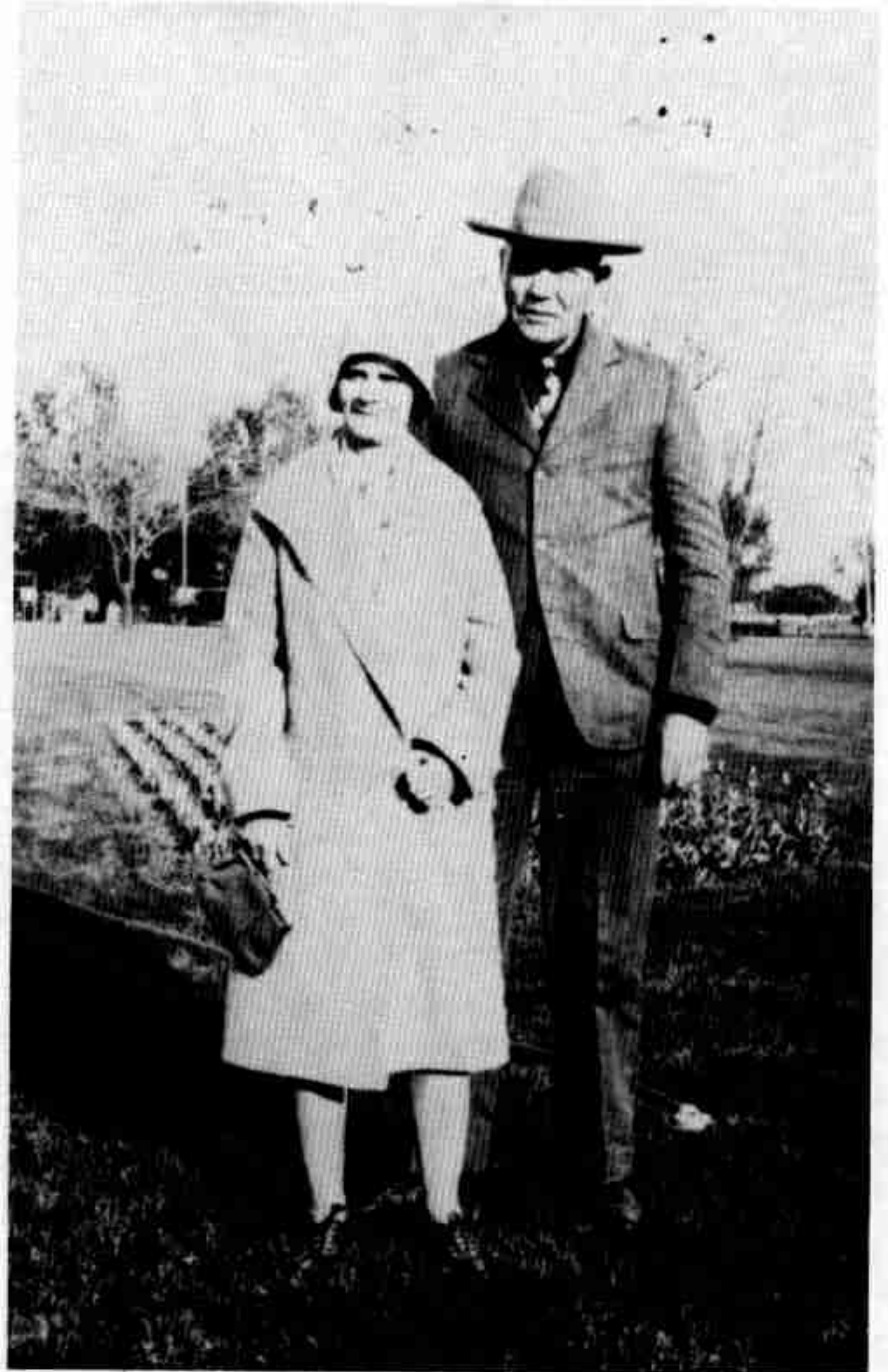
In later years

Soon after the Twin Falls tract opened, we came to the Salmon Tract drawing and we were lucky, we drew a forty acres on the Salmon Tract. We went back and sold our sawmill and home and moved two and one-half miles west of Kimberly, Idaho in August 1908. The farm we bought